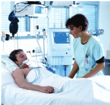
Hamilton Intelligent Ventilation